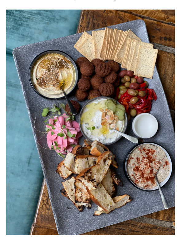
Dips Platter $55 3 middle eastern dips, olives, warm Turkish bread, crackers, falafels & pickles