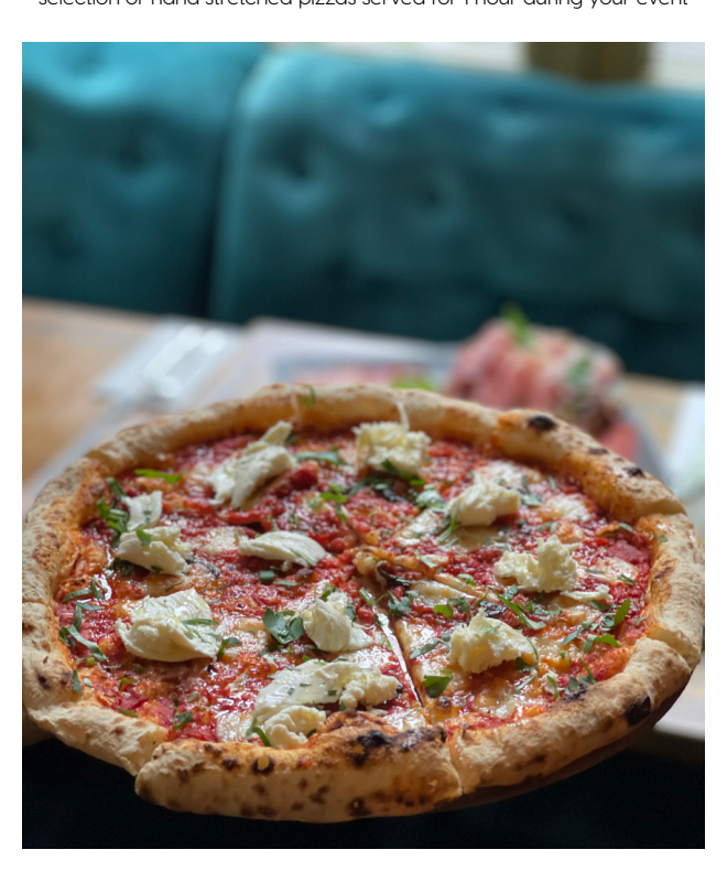
Artisan Pizza platters ($10pp) unlimited margherita, BBQ chicken, hawaiian pizza selection of hand stretched pizzas served for 1 hour during your event